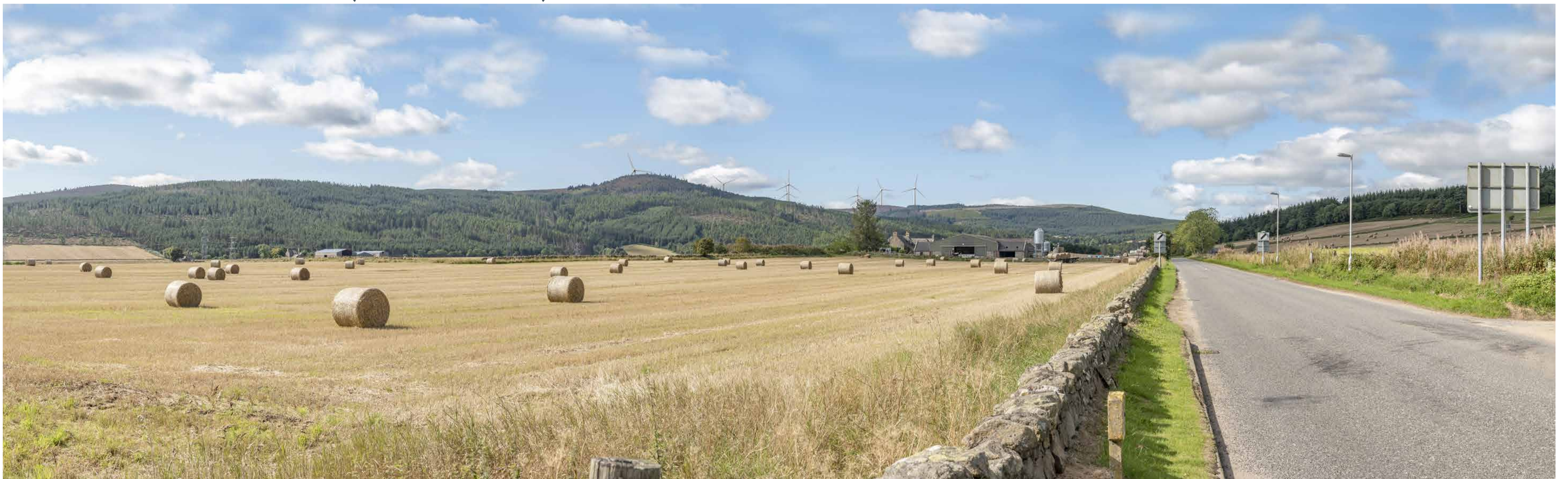
PHOTOMONTAGE OF PROPOSAL (UPDATED DESIGN)