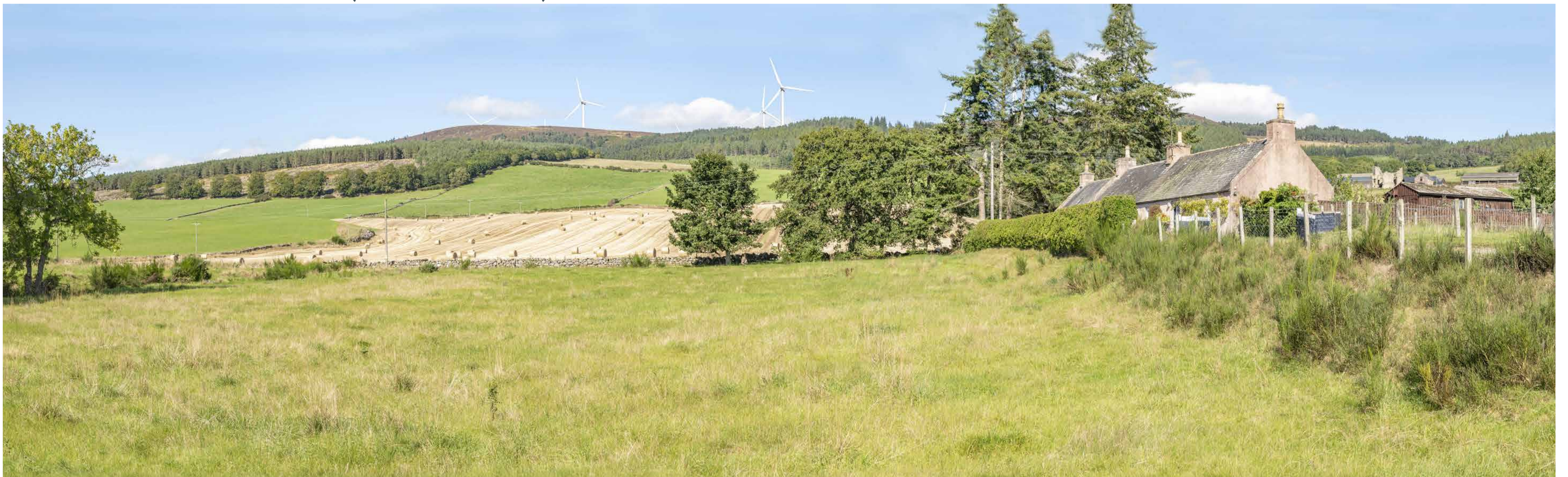
PHOTOMONTAGE OF PROPOSAL (UPDATED DESIGN)