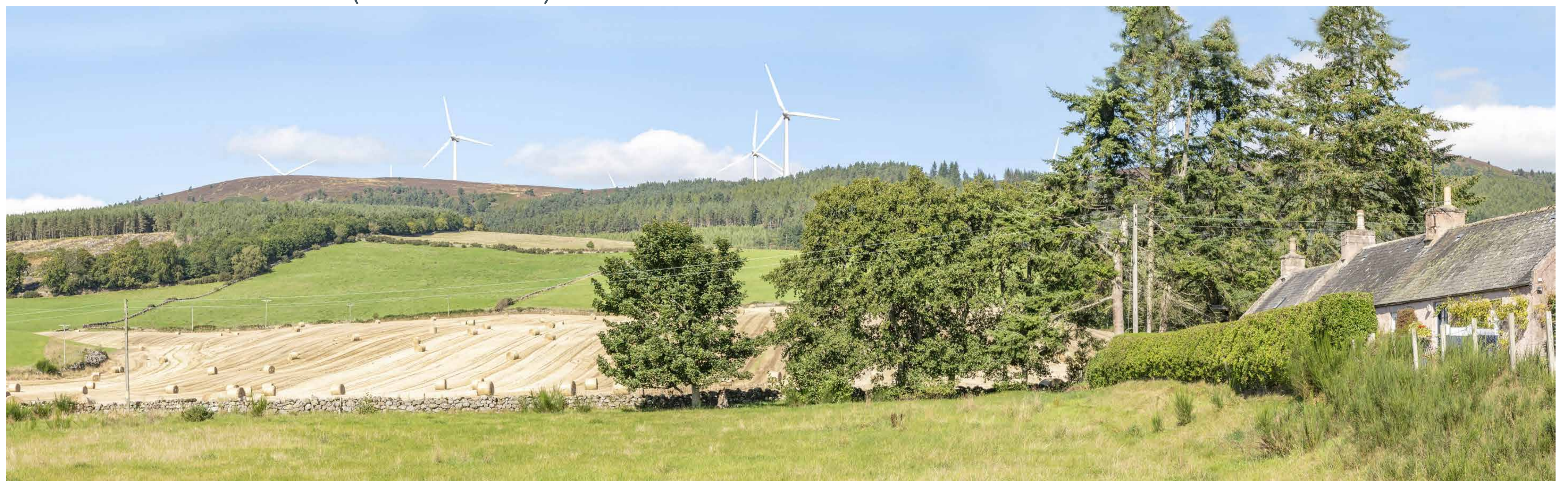
PHOTOMONTAGE OF PROPOSAL (UPDATED DESIGN)