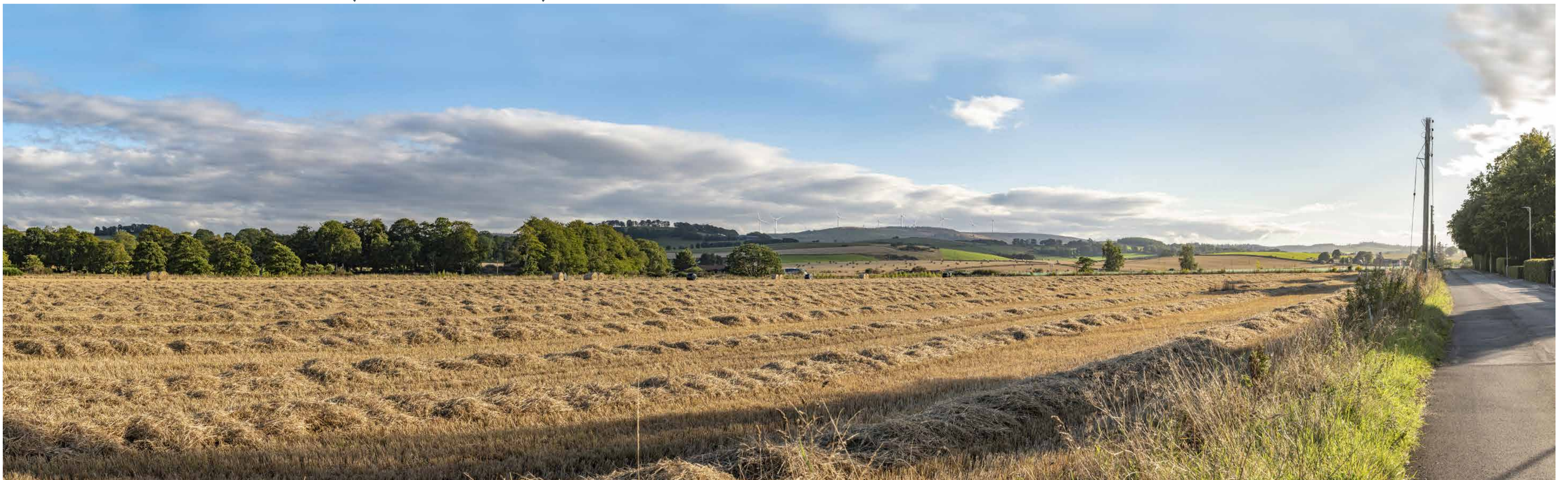
PHOTOMONTAGE OF PROPOSAL (UPDATED DESIGN)