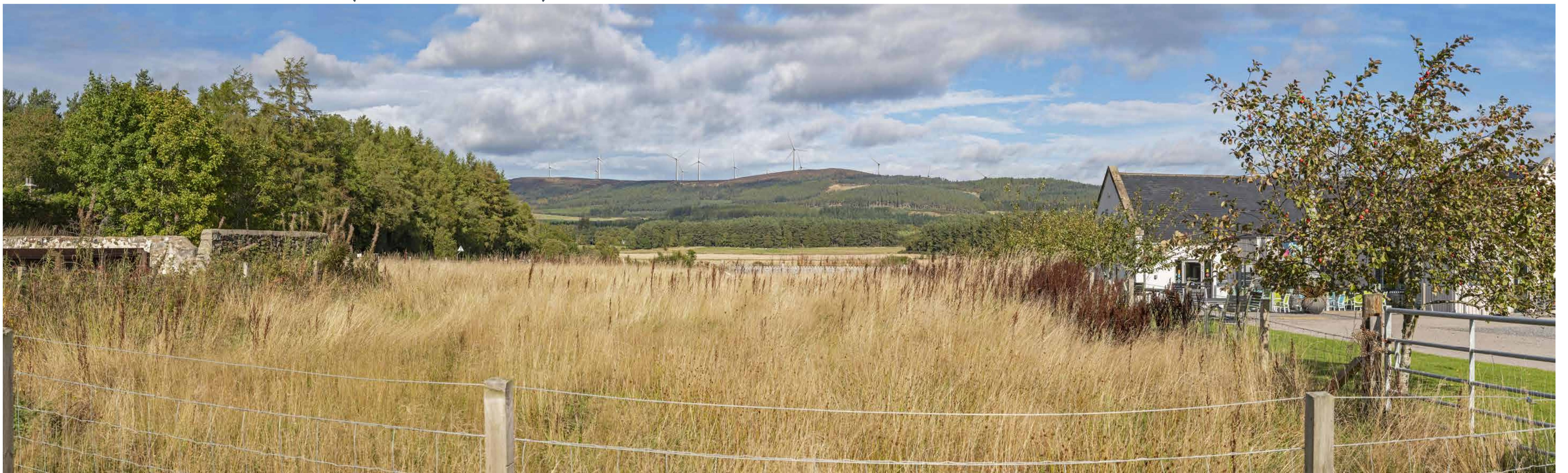
PHOTOMONTAGE OF PROPOSAL (UPDATED DESIGN)