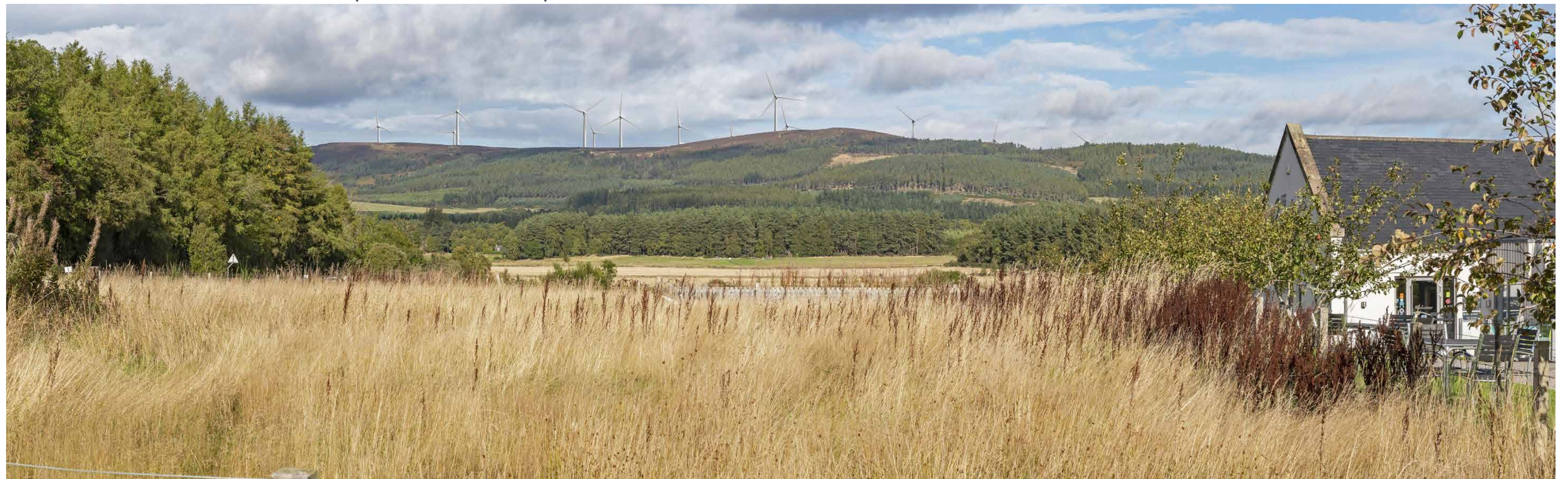
PHOTOMONTAGE OF PROPOSAL (UPDATED DESIGN)