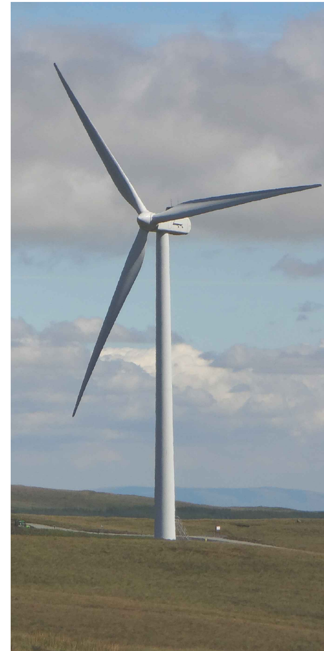
PHOTOGRAPH OF TYPICAL TURBINE